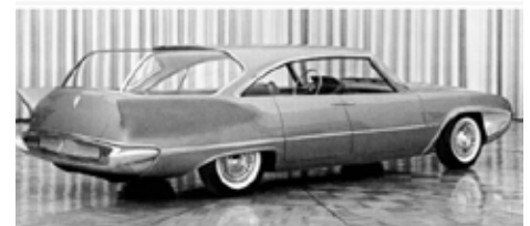
It's like the designers of the 1950s never heard of the greenhouse effect: it would take a powerful air conditioner to compensate for that back glass area!